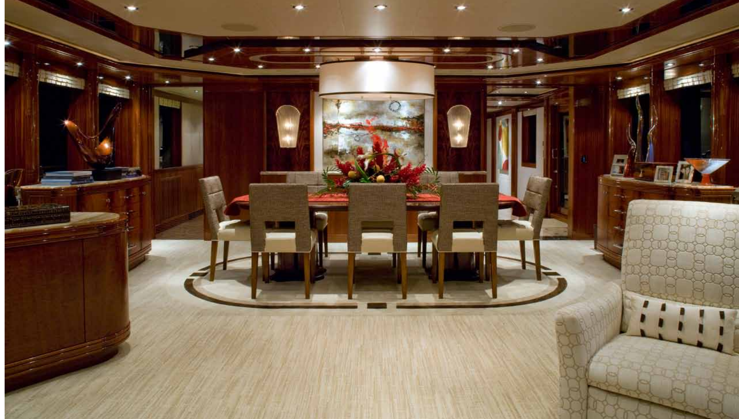
Right & Below: 'Boardwalk's owner wanted the yacht to be sophisticated, yet remain inviting and durable enough for family time.

Westport replaced stainless countertops with granite and selected leather for the barstools and settee in order to