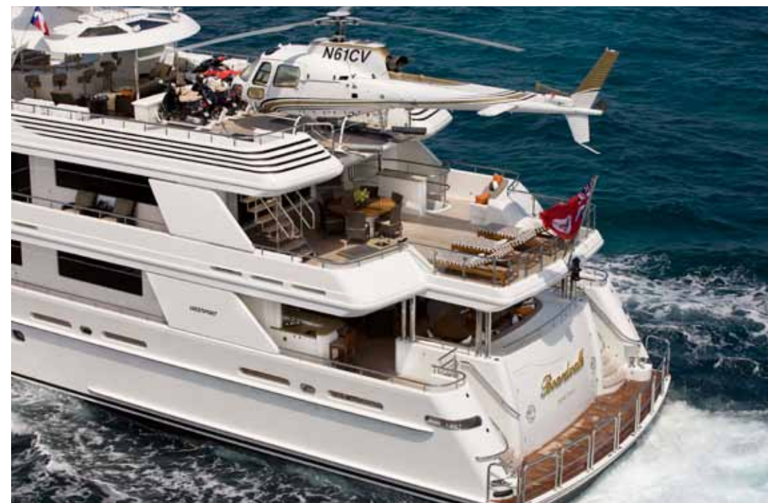
Above & Left: 'Boardwalk' has excellent on-deck spaces for maximum enjoyment, whether entertaining or relaxing.